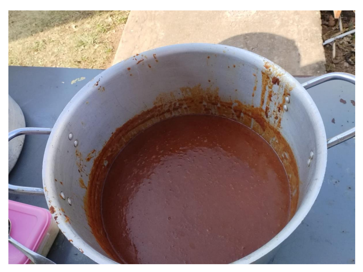
Continuation of the soup kitchen pictures.